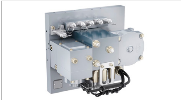
FlexControl Lite (only core function module)